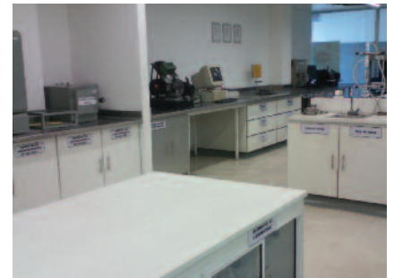
R&D inspects both incoming raw materials and finished products

Marathon's research and development team plays an integral role in the overall quality control system. Incoming raw materials undergo rigorous testing including ash (%), loss of ignition, oil content, acetone extraction, screen analysis, moisture (%), specific gravity, bulk density, phenolic resin curing and flow tests.