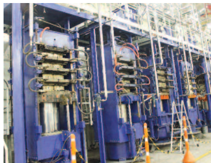
Computer controlled hot presses ensure optimal product curing

The new Marathon facility features a world class process that incorporates several new manufacturing technologies. Among the processes utilized in the new plant are a geothermal cooling system to maintain optimum and consistent humidity and temperature, an automated raw material weighing system to ensure batch-to-batch consistency and a proprietary process for transfer of raw material mix into the hot curing presses.